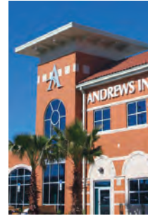
The Complete Athlete has received the endorsement of Dr. James Andrews, and conducts Coaches Certifications several times yearly around the U.S.

As with all Complete Athlete programs, the Complete Athlete faculty will not leave until all your questions are answered or addressed. Each participant has our unconditional money-back guarantee that if each event isn't worth the full price and more, we will refund your full fee no questions asked.