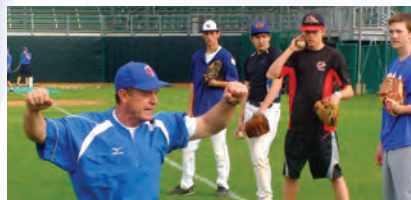
CA's Dynamic Warm-Up cuts by 1/2 the number of throws needed to perform, reducing wear and tear on vital muscles and tendons. It's one of several proprietary methods our athletes learn from day one.