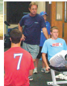
The CA Staff guides players through ongoing weight room sessions explaining proper lifting for throwing health and strength.

The one-of-a-kind Collegiate Prep isn't a one-shot deal designed to provide some playing time and a push. Climbing the pyramid to the highest levels of this sport takes a lot more than heaping a bunch of lessons on top of a hefty select season. That isn't the route to achievement. If you want collegiate-level training, testing and performance, CA will get your head and body ready to bring your best in reaching your playing (and playing level) goals.