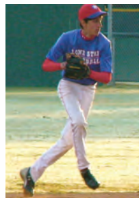
How do you grade out defensively? Collegiate Prep trains you how to set and achieve higher standards all around the diamond